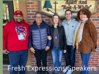
Fresh Expressions Speakers