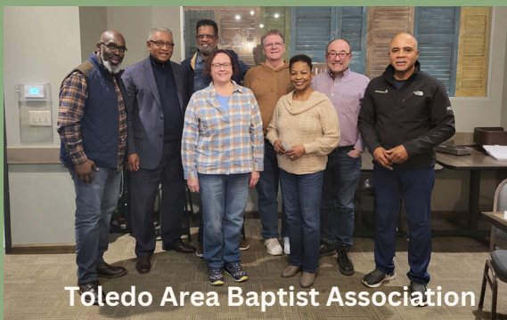
Toledo Area Baptist Association