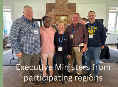
Executive Ministers from participating regions